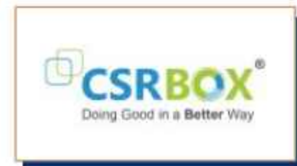
CSR BOX IBM SKILL BUILD