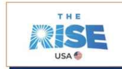
RISE IN USA