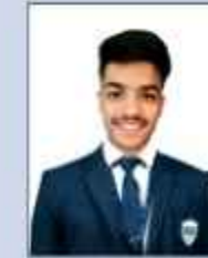
HARSH RAJAK IT